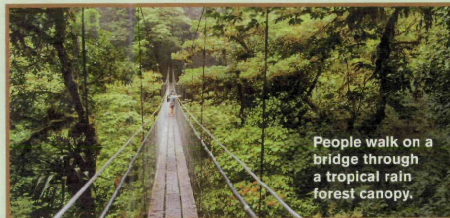
People walk on a bridge through a tropical rain forest canopy.

Animals such as jaguars can be found on the dark forest floor .